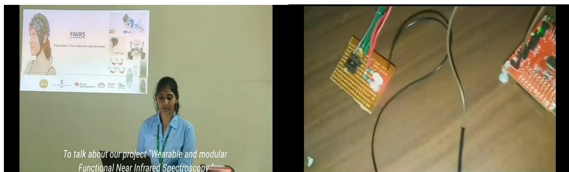
Wearable and Modular Functional near infrared spectroscopy